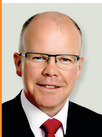
Aontú Leader PEADAR TÓIBÍN TD

Communities feel under siege due to the increase in crime and anti-social behaviour. We have one of the lowest numbers of police per capita in the EU.