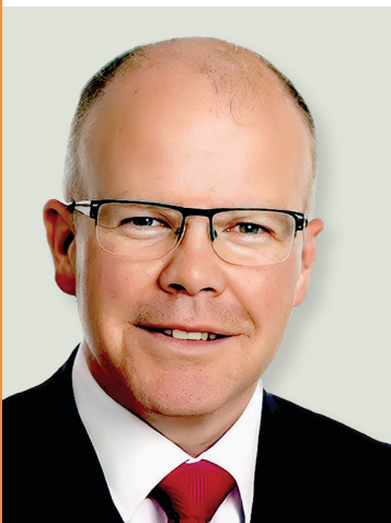
Aontú Leader PEADAR TÓIBÍN TD

The area around Macroom is rural and agricultural. The local village was once the epicentre of life and over time this moved to the nearest town. It is vital that local communities support their local shops and businesses, however Rosarie would also like to see greater supports for small businesses and farmers in the mid-Cork area.