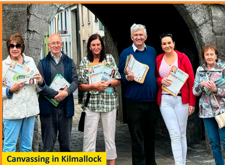
Canvassing in Kilmallock