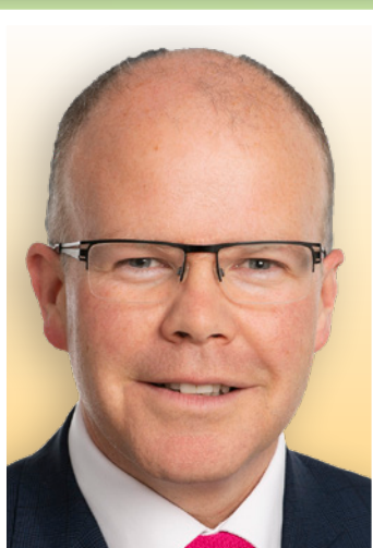
Aontú Leader Peadar Tóibín TD

Aontú will: • Increase the amount of frontline health workers. • Provide decent pay and conditions to keep Irish doctors and nurses at home. • Decrease bureaucracy. • Protect regional GP services from closure. • Create a parallel mental health service for all ages with a dedicated multi-year budget.