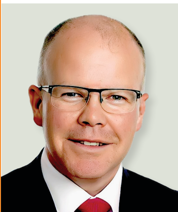
Aontú Leader PEADAR TÓIBÍN TD

Many citizens live in fear of crime daily. Lanes off main streets are off limits due to open drinking and drug taking. The murder rate in Ireland has doubled this year alone. Rape and sexual assaults have doubled in the past decade.